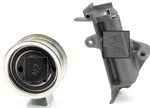
Photo 2: Tensioner pulley 531 0436 20 with vibration damper 533 0035 10